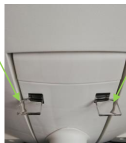
Detail of the seat

Lever used to lock the backrest position. Push the lever forward to release the backrest. Push the lever back in the working position to block the backrest.