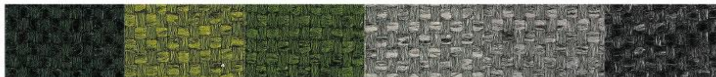
9707 Verde scuro