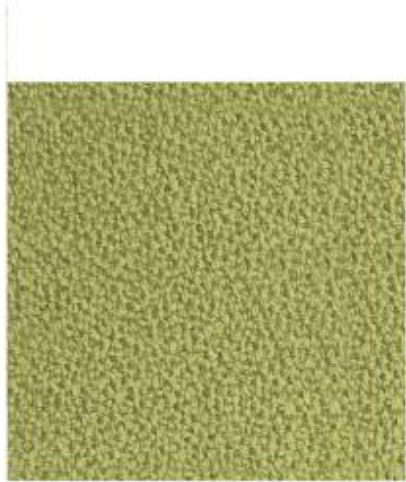
6851 Verde chiaro