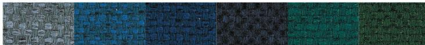
9605 Azzurro ceruleo