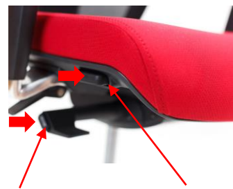
Button for locking synchronous mechanism A with automatic pressure control according to user weight