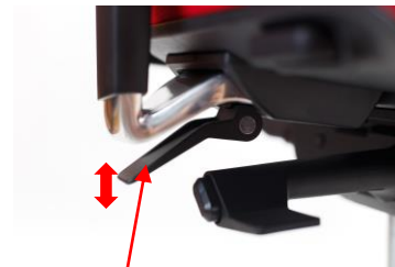
Lever for simple width adjustment of armrests