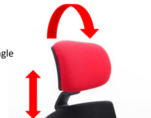
Headrest adjustable in height and angle