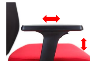
3D adjustable Z0 and Z1 armrests with softened polyurethane foam on the touch part, Options of regulation: height and width forward / backward