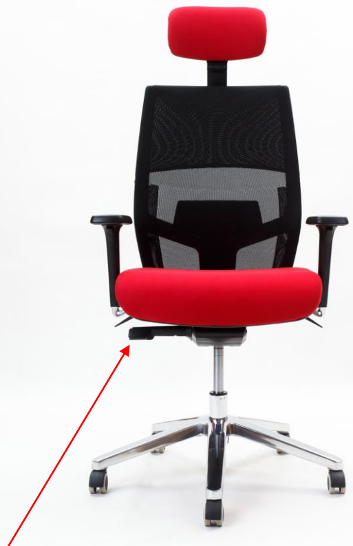
Lever for height regulation A mechanism The lever includes a control button for locking of the synchro mechanism