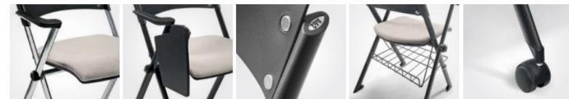
962 Armrest 975 Writing table 973 Row and seat ID 972 Magazine holder 328 BP Casters