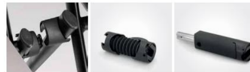
958 Simple link 971/DP Removable link For armchair 971 Link for armchair