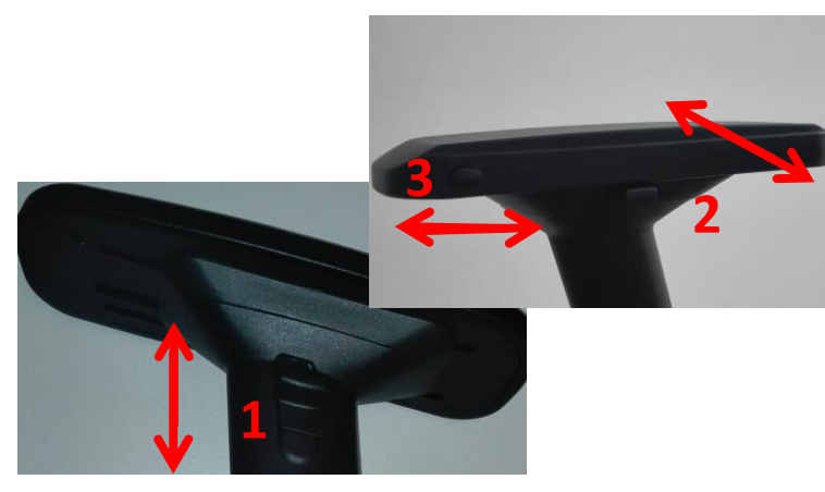
3B armrests – 1. height and 2. width adjustable, 3. forwards/backwards