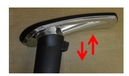
1B armrest – height adjustable, rotatable left/right